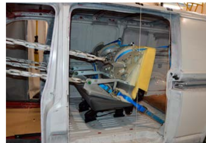
▲ TEST 2 (AFTER) triple folding bench seat, second row