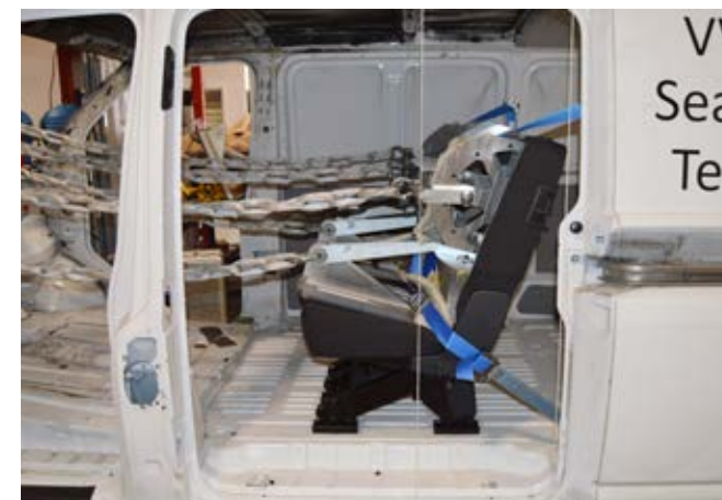
▲ TEST 1 (BEFORE) Single nearside seat and double offside bench seat, second row