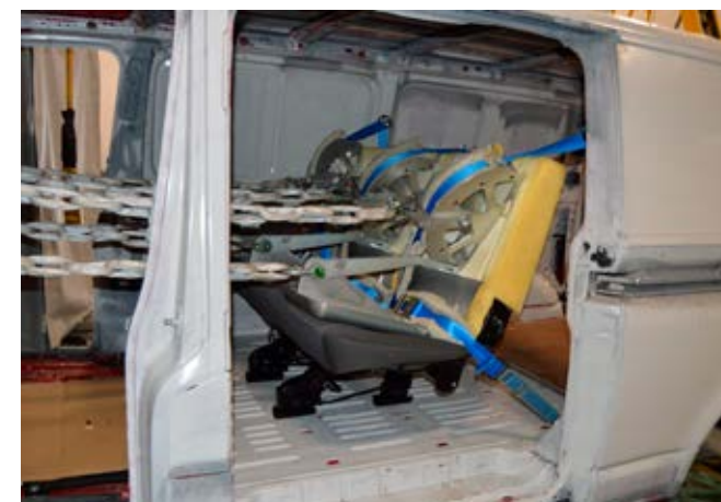
▲ TEST 2 (BEFORE) triple folding bench seat, second row